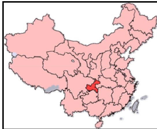
1.Chongqing Municipality location in China

First comes the historical justification. The city played important role during more than 2000 years of its history ( in 18981, for example it became first inland port in China open for foreign commerce ). In XX century Chongqing was national capital during the Second World War and Japanese invasion (Nationalists government). Since than it enjoyed higher political status and economic independence then any other city of the same size in whole western China. After 1949 the city was still separately administered until 1954 when it was downgraded to a sub-provincial city in Sichuan province. From that time until 1997 Chongqing and Chengdu (capital of Sichuan) had very turbulent relationship. There was constant competition and Chengdu benefited from considerable subsidies of provincial government to improve its political and economic significance. The leaders of Chongqing expressed their feeling that the city development is scarified to support the capital of the province. 4 As a result the municipality “changed hands” in different times and as a matter of fact more often it was under direct administration of Beijing than Chengdu.